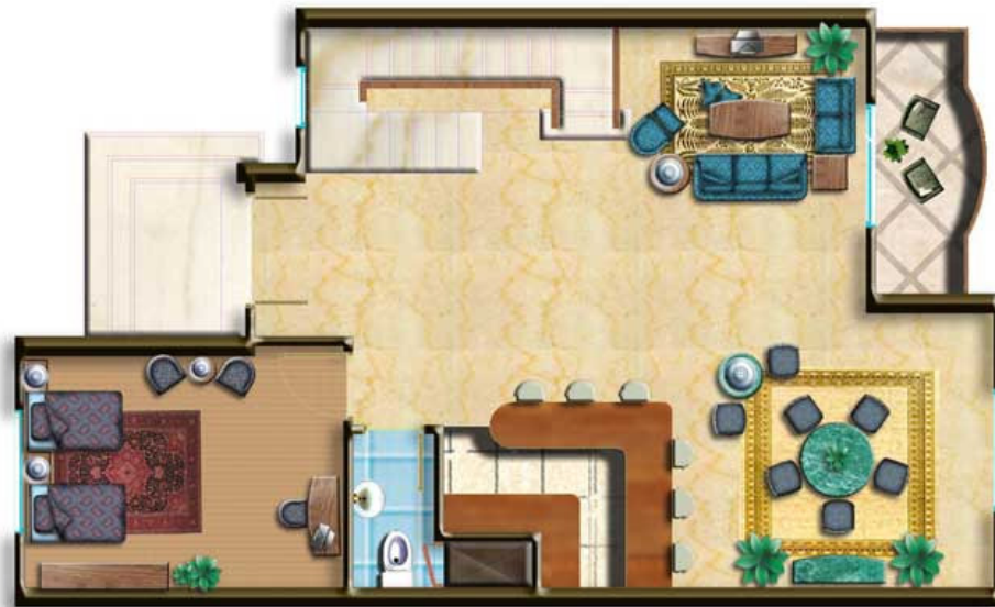
VILLA (A) 148m 2