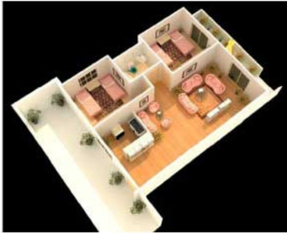
Main floor layout of all two bedroom apartments