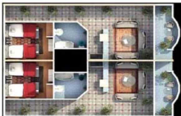
Example Floor Plan